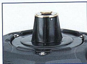
1" thread For the attachment of the multi-function nozzle.