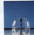
Lava 36-10 K Ø 95 cm