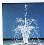
Vulkan 37-2,5 K H: 400 cm

With 1" thread for attachment to the Pond-jet's multi-function nozzle.