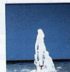
Schaumsprudler 35-10E, H: 140 cm