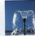
Calyx 36-10 K Ø70 cm

*For order no. and product details, see pages 20 – 21