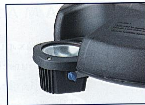
Accessories: Lighting set Three Lunaqua 10 spotlights, can be ordered separately.