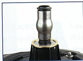
Multi-function nozzle Here, as an example with a mounted Schaumsprudler 35-10E.